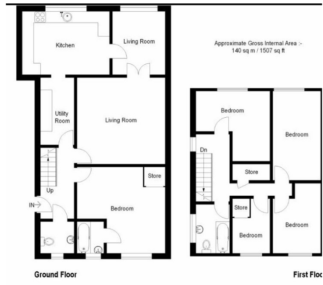
Illustration For Identification Purposes Only, Not To Scale /ID13176 Ref-6814

Ordnance Road, Canning Town, London, E16